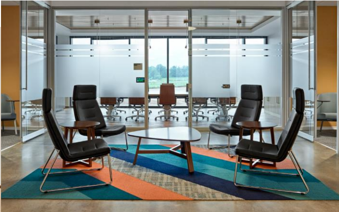
Lee Company, Franklin TN: Project Managed