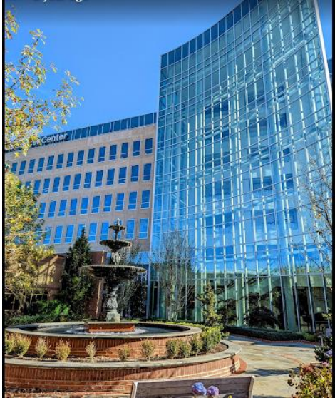
Gibbs Cancer Center- Pelham: Designed and Project Managed