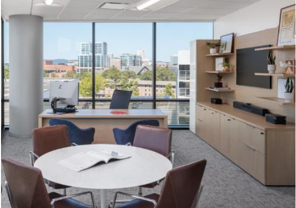
Greenville County Administration Building: Designed and Project Managed