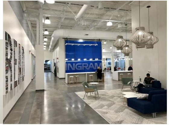
Ingram Content Group, La Vergne TN: Project Managed