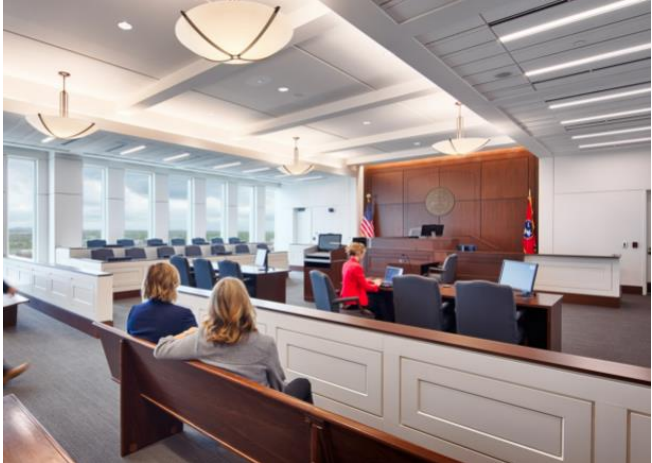
Rutherford County Courthouse, Murfreesboro TN: Project Managed