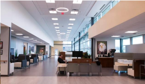
Clarksville VA Clinic, Clarksville TN: Project Managed