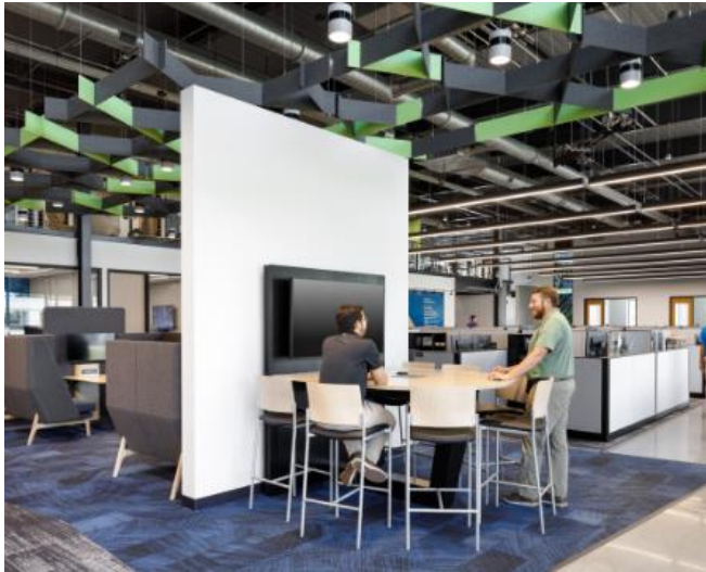
Morgan Corporation: Designed and Project Managed