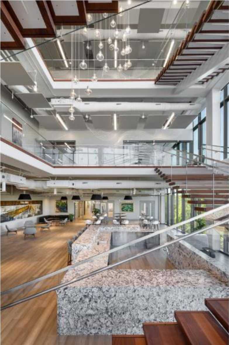
United Community Bank- Greenville, SC: Designed and Project Managed